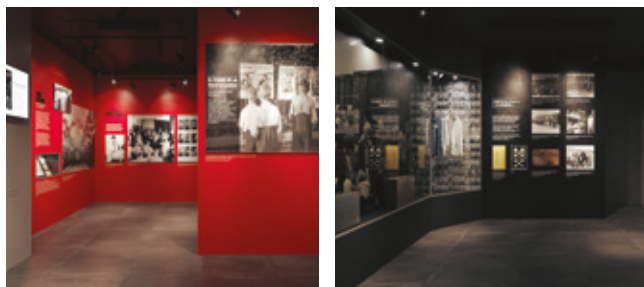
Images of the new permanent Holocaust/Shoah exhibition, which opened in April 2022 thanks to private donations.

Given the growing need for teaching about the dangers of hate speech and antisemitism, the permanent Shoah exhibition has been redesigned. Due to the high transportation costs, some schools are unable to be part of this important educational experience. Donations to be raised for 40 buses/year: US$ 7,000.